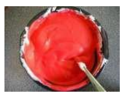
TOP: With liquid paint. BOTTOM: with powder paint