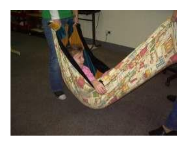
Most Children Love to go Up and Down